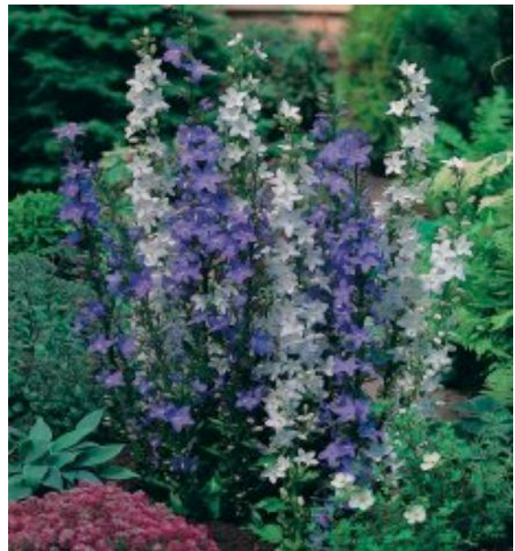
Campanula pyramidalis (up to 6' tall!).

Tree bark, like French, becomes much more relevant when you have an immediate need for it. If, for example, you decide rather late in the winter that you are going to be self-sufficient in the pancake department and make your own maple syrup, you may find yourself out in the woods with a bit and brace, a bag of metal spouts, a growing realization that you aren't quite sure which trees are sugar maples. This invariably leads to an intensive study of the tree bark, because there is nothing more embarrassing than having else point out that you have tapped an elm. ~From " Earthly Pleasures: Tales from a Biologist's Garden " by Roger B. Swain.