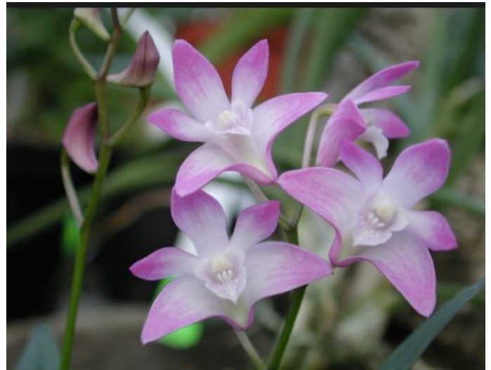
Dendrobium kingianum.

Plant Table With fewer plants on our potting tables, let's be creative this month! Do you have any plant or garden-related objects you would like to pass along? Pots, watering cans, and interesting accessories are welcome. Bring them to the January meeting and we'll see if anyone wants to buy them!