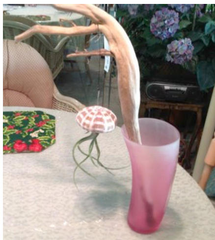
Tillandsia masquerading as a jelly fish, December 2014.

Western Horticultural Society ~ January 2015