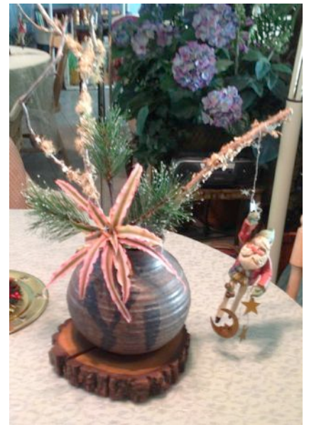
Cryptanthus Christmas Arrangement , December 2014.

Western Horticultural Society ~ January 2015