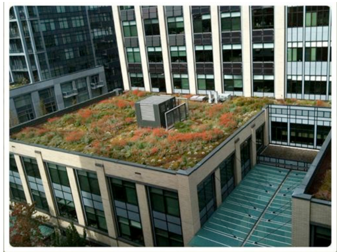
Cistus Design—M Financial Building in Portland, Oregon.

Join us for a talk about new finds from the wilds of the west to the far east, concentrating on beauties new to cultivation that love a summer dry climate. Sean Hogan’s talk will feature bold architectural plants that tolerate more abuse than you’d think, and highlight Cistus Nursery introductions and plants just arriving and available in the Bay Area. Cistus Nursery is a retail micro-nursery located on scenic Sauvie Island, fifteen miles northwest of Portland, Oregon. Cistus offers Mediterranean-climate, southern hemisphere, hardy tropical plants, and more.