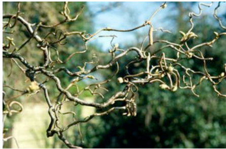
Corylus avellana 'Contorta', Harry Lauder's walking stick or Corkscrew Hazel.

Cistus Nursery is a two-acre retail nursery near Sauvie Island new Portland, Oregon, You would have to label it a "collector's nursery," as its inventory of different plant types is too numerous to list on one page (to wit, if you like Pittosporums, Sean's outfit grows 121 varieties!)