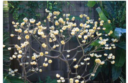
Edgeworthia chrysantha in full bloom, February 2013.