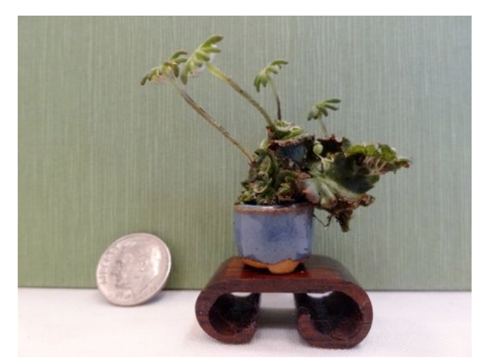
Liverwort Bonsai.