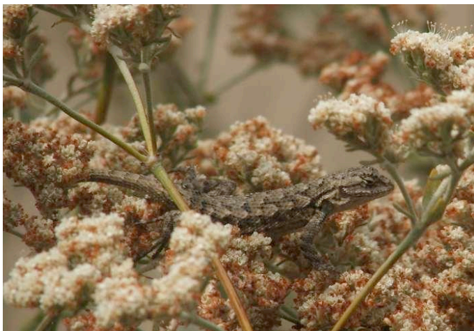
Eriogonum giganteum , St. Catherine's lace flowers are big enough to support all sorts of life.

fasciculatum , E. giganteum , E. latifolium rubescens , and E. parvifolium . What a display that must have been! ~Nancy Schramm