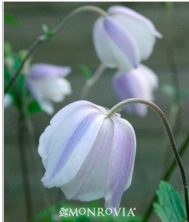
Wild Swan™ Hybrid Anemone, Anemone x 'Macane001' Wild Swan™ An exceptional new selection, offering prolific flowering from June until frost, surpassing that of the Japanese hybrids! Nodding buds atop tall stems open into pure white flowers with a blue violet reverse. Blooms are held high above deep green foliage. Does not re-seed. Perfect for massing in a woodland setting or spotting into rock gardens. Excellent cut flower. Herbaceous.