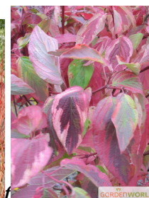
Cornus sericea 'Hedgerows Gold'