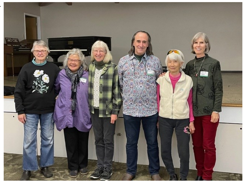
Previous Founder Award Recipients

When not nurturing her extensive and "all favorite" plant collection, our awardee likes to play Mahjong and spend time with her husband, friends and family.