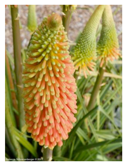
Red Hot Poker, Kniphofia uvaira. Growing at the Master Gardener Palo Alto Demonstration Garden, 851 Center Dr., Palo Alto. This waterwise garden is open dawn to dusk, 365 days a year. Find cultural info on Kniphofia and 100+ other waterwise plants that grow at the Master Gardener demo garden at mastergardeners.org/plant-dictionary.

Don has observed (and I find this fascinating) that three plants that he has seen surviving time and again around old, abandoned homesteads are figs, pomegranates, and redhot pokers. Give them at least a half a day of sun (full sun is better) and water to get them established, and you've probably got this one for life. There are loads of species (maybe thirty?) and as of 1992 over 60 cultivars. There are some as small as eighteen inches tall and some that will get over six feet tall. The flowers grow in clusters ranged along a central spike, looking for all the world like a small torch. Flower spikes stand proud of the clumping, grassy foliage, and range in color