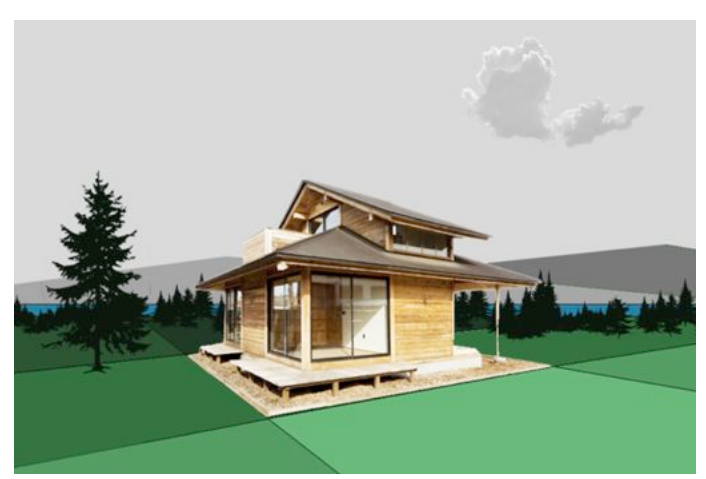
RIKYU House from Joinery Structures. "RIKYU House blends the elegance and sensitivity of traditional Japanese design with a sincere and holistic commitment to green building. Through a patented building system enabling custom design and the use of standardized parts, RIKYU House is aesthetically beautiful, environmentally conscious, and affordable." Photo and caption: http://www.joinerystructures.com .

Paul Discoe's lectures on Zen design principles, Wabi Sabit and related topics can be found on YouTube. For more info: http://www.joinerystructures.com.