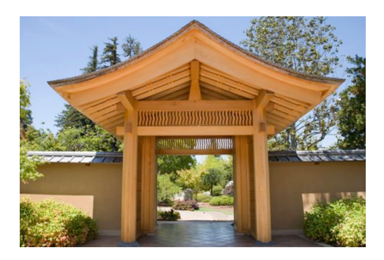
Custom home design by Joinery Structures (for a complex in Woodside, California). Photos from Joinery Structures , http://www.joinerystructures.com