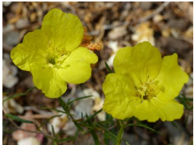
Calylophus drummondii.