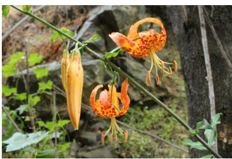
Humboldt lily in La Tuna Canyon, Rancho Santa Ana Botanic Garden, Claremont, California.

Do you know the three critical actions to take to assure that your garden survives and thrives in these times of dramatic weather fluctuation? You may think, "Water, water, and water" but that's just one of the fundamentals that you need to be concerned about now and into the future when thinking about your garden.