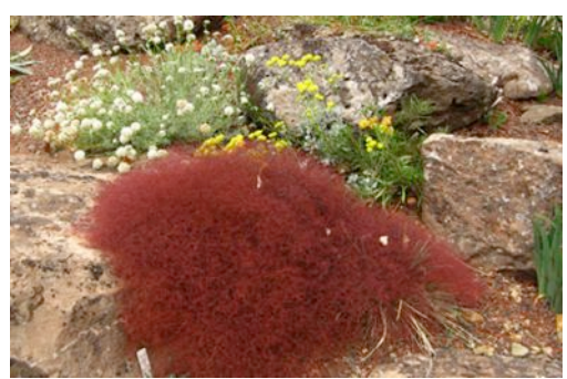
Eriogonum parishii, a native buckwheat now in bloom at Tilden Park.