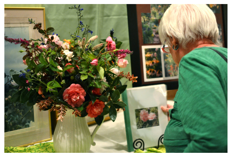
A bouquet of flowers from Barbara's garden and photo of one of her roses.