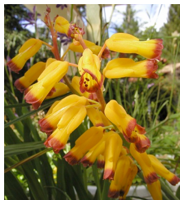
Lachenalia aloides ‘Pearsonii’