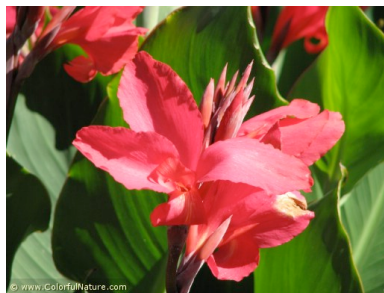
Canna indica (edible roots)